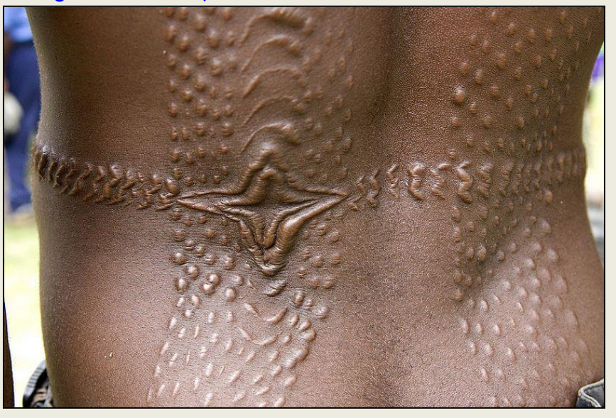
ECOTOURISM MELANESIA LTD

17:00 Rendezvous with your vehicle and commence the two hour drive back to Wewak - it often rains in the late afternoon so if the "daily deluge" begins earlier than expected you are welcome to request an earlier return to Wewak. (The car and driver will be there early). 19:00 Arrive back at your hotel in time for dinner. (If you're going to be late we'll call ahead and ask the kitchen to keep dinner for you). Overnight 4 star accom, Wewak - includes hot breakfast